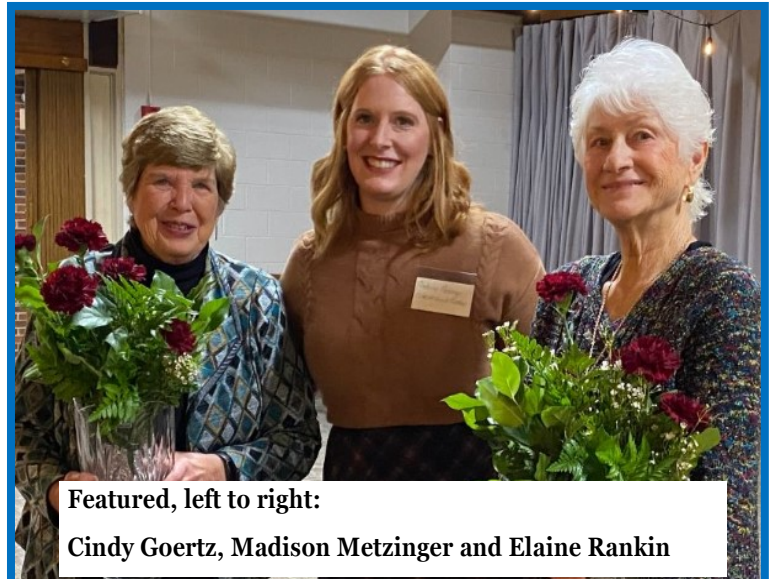
Featured, left to right: