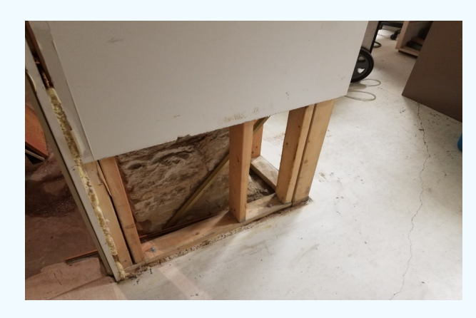
Snapshots of the basement post floods! Construction continues!